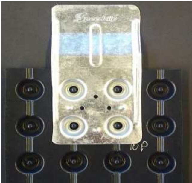
Figure 3. Anchor