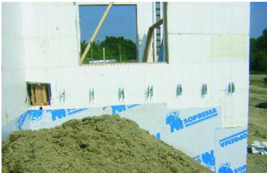
Figure 12.4 – Peel and stick waterproofing membrane installed and ready to be backfilled

In most cases the manufacturer will also recommend a specially formulated primer to be applied to the face of the EPS before applying the membranes which will help improve their adhesion. Peel and stick membranes may require a protection layer against sharp/heavy gravel. Check manufacturer specifications.