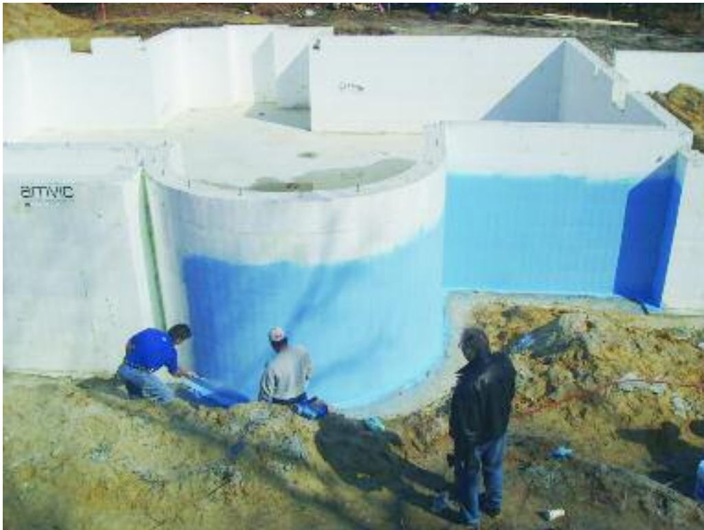
Figure 12.3 – Spraying liquid applied membrane on Amvic ICF

To protect the liquid applied membrane from sharp/heavy gravel in the backfill soil, Amvic recommends installing protective boards or drainage composites. The protective boards/drainage composites will be applied over the liquid applied membrane and have the added benefits of additional moisture protection and provide air channels for water to be carried by gravity to the footing drain.