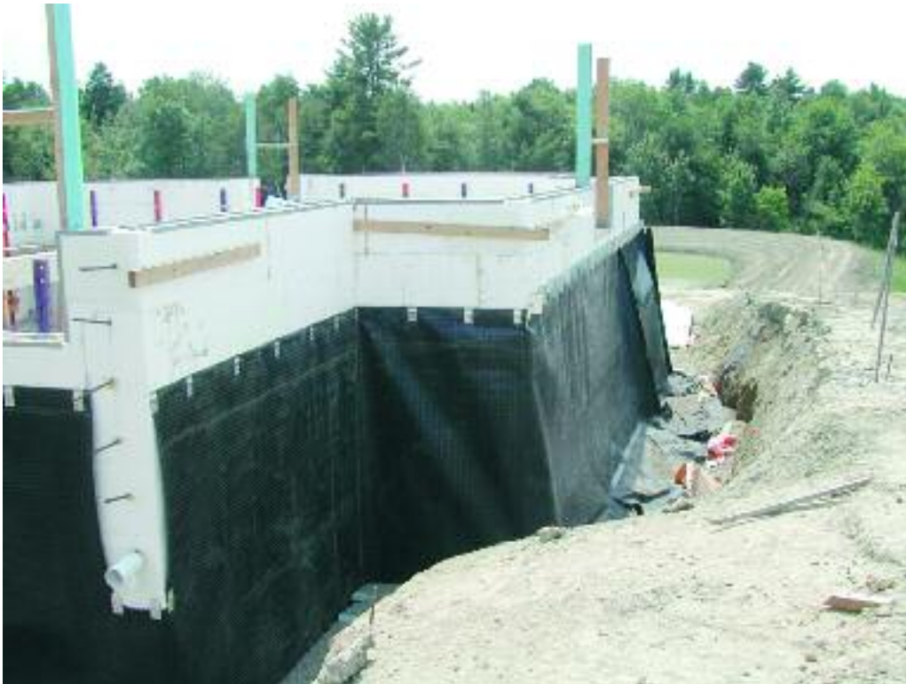
Figure 12.5 – Installed dimple sheet membrane

Dimple sheet membranes are wrapped around the foundation walls with the dimple side facing the EPS on the Amvic ICF creating an air gap between the back fill soil and the walls. This air gap prevents the build up of direct hydrostatic pressure over the walls and thus moisture in the soil cannot penetrate through to the inside of the basement. When installed properly, dimple sheet membranes have been used with success throughout North America.